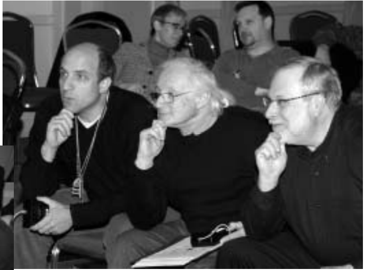
The 3 'Thinkers'