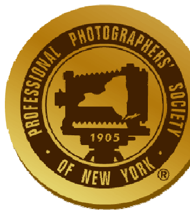
PHOTO IMAGING WORKSHOP